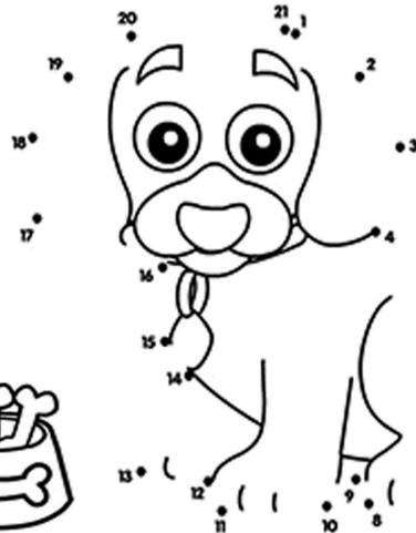
CAN YOU JOIN THE DOTS ON THE TORFIN PUPPY?